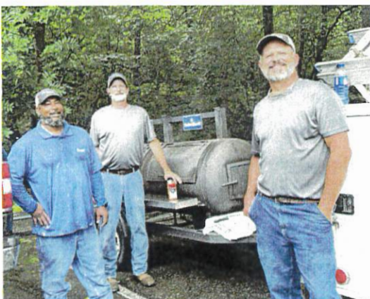
The men behind the food! Your Grill Master's