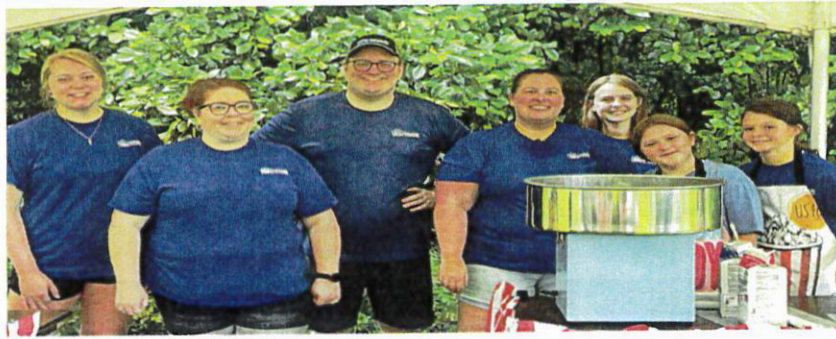
Our Staff and Volunteer's getting ready